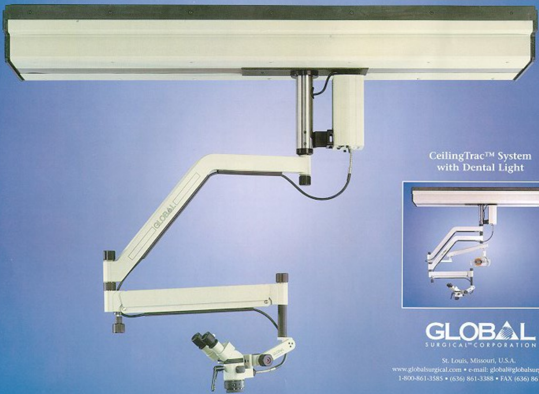
CeilingTrac™ System with Dental Light